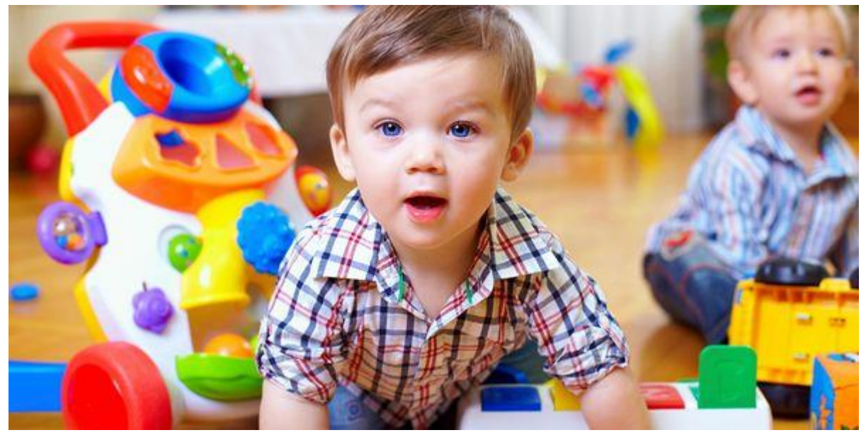
Quality. Connection. Care.

Meadowlark Children's Center is a childcare center located in the Messiah Lutheran Church. We are dedicated to providing quality care to children 0-6yrs of age. As a small facility, we can provide individualized care for every child.