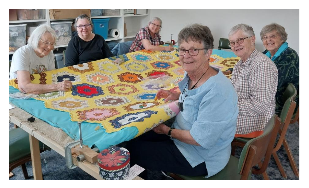
Charity Quilters working together on this lovely hand quilted creation. You just cannot get this kind of love in a store bought quilt.