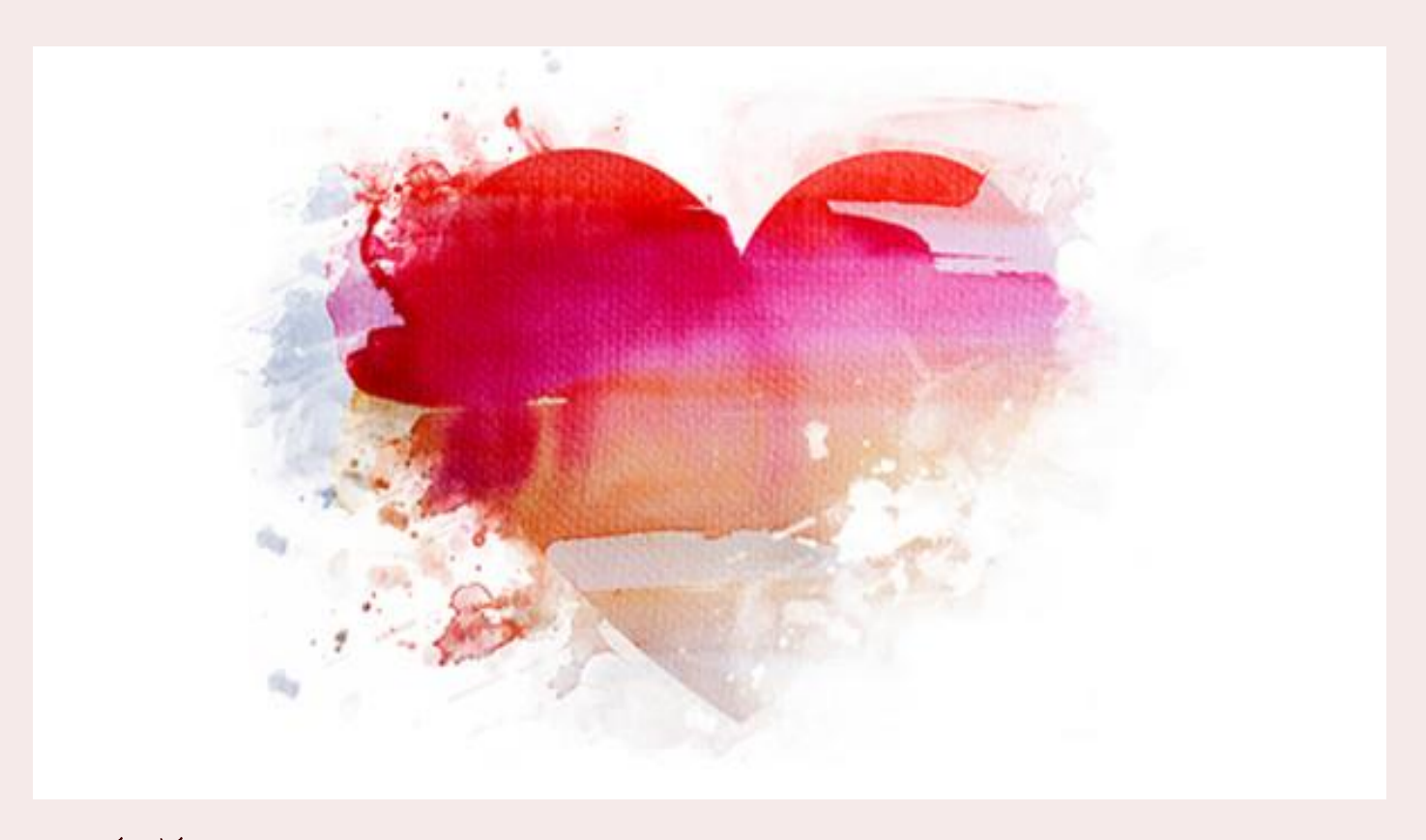
1 Corinthians 13:4-8, 13

<sup>4</sup> Love is patient; love is kind; love is not envious or boastful or arrogant <sup>5</sup> or rude. It does not insist on its own way; it is not irritable; it keeps no record of wrongs; <sup>6</sup> it does not rejoice in wrongdoing but rejoices in the truth. <sup>₹</sup> It bears all things, believes all things, hopes all things, endures all things.