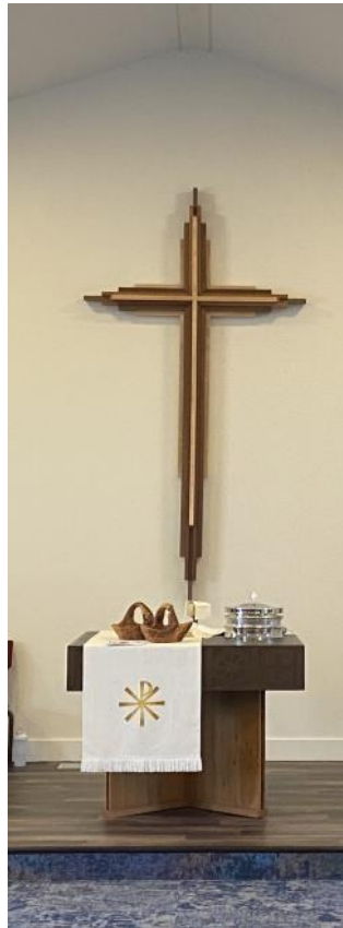
Communion—All are welcome for it is the Lord's table, not our table.