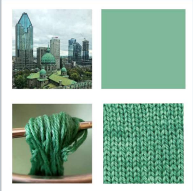
Go from color inspiration to color application quickly.