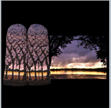
Handspun and dyed gloves (left) were created with the colors from the sunset photo (right) using my personally developed color matching dye methods.