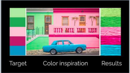
Learn the techniques to get repeatable and accurate results no matter the brand of dyes you use.