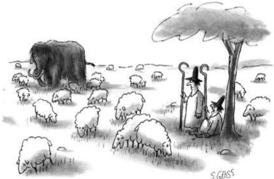
"As long as it's woolly I don't ask questions."