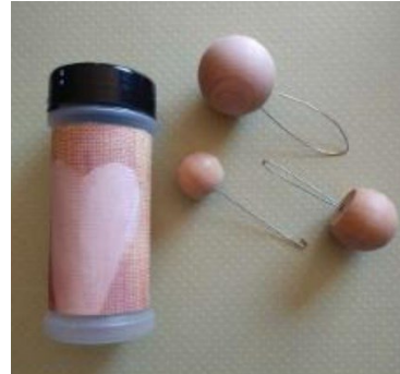
Thank You! David Kish

HANDCRAFTED HEDDLE THREADERS AND ORIFICE HOOK: Orifice Hook: $8.95 / 4pc Set (as shown) $19.95 / 3pc Set (two size heddle THREADERS in storage case). FREE S & H! Place order at: www.ebay.com/str/EklectikKish