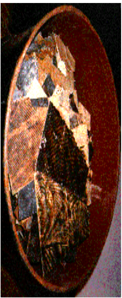
Improperly stored asbestos tiles. Asbestos must be adequately wet to prevent fiber release, stored wet in properly sealed bags with a proper waste label.

Other Cancers — breathing invisible or visible asbestos particles can cause cancer. Fibers not deeply imbedded in lung tissue are removed by tiny hairs, travel up the throat in mucous and are swallowed. As such, cancer can also form in the larynx, esophagus, stomach, intestines and rectum.