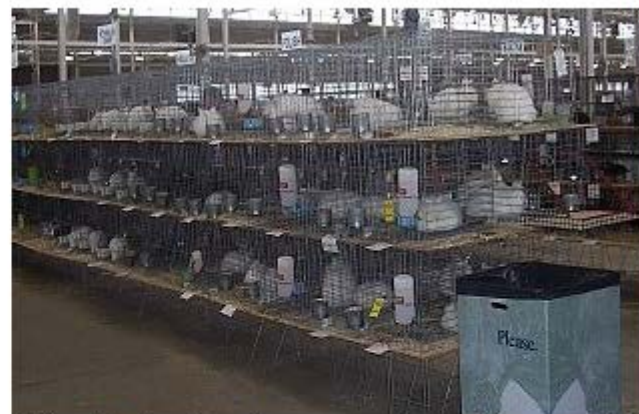
The Lionhead cooping wrapped around one end of the cages since we had so many entries.