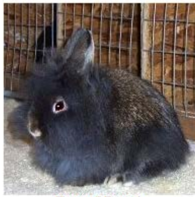
Best of Breed Junior Chestnut Agouti Buck