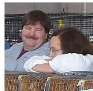
A break in the tension as COD holders share a happy thought.