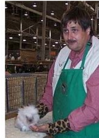
was a junior Sable Point doe