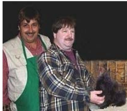
was won by a lovely little junior Chestnut Buck