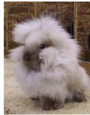
Best Opposite Sex to Breed Junior Sable Point Doe