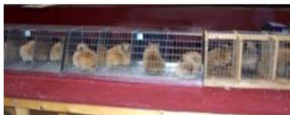
One of the large junior Tort classes waiting for the judge during the Convention Show.