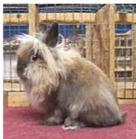
Best of Breed Junior Tortoise doe