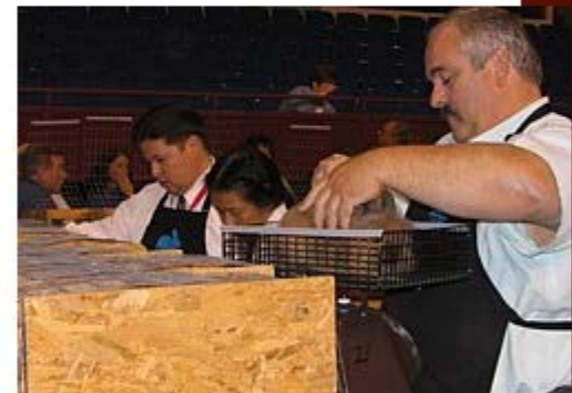
each is weighed, measured and examined by 9 judges for any faults.