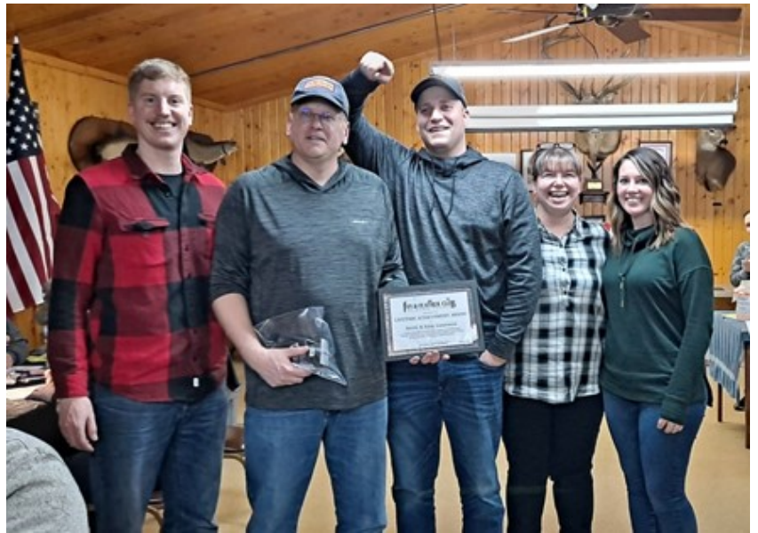
Some of the team members from Smith & Eddy Insurance with their Life Time Achievement Award.