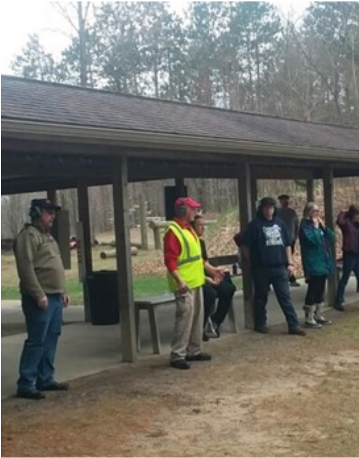
Shooters at the April CPL Class