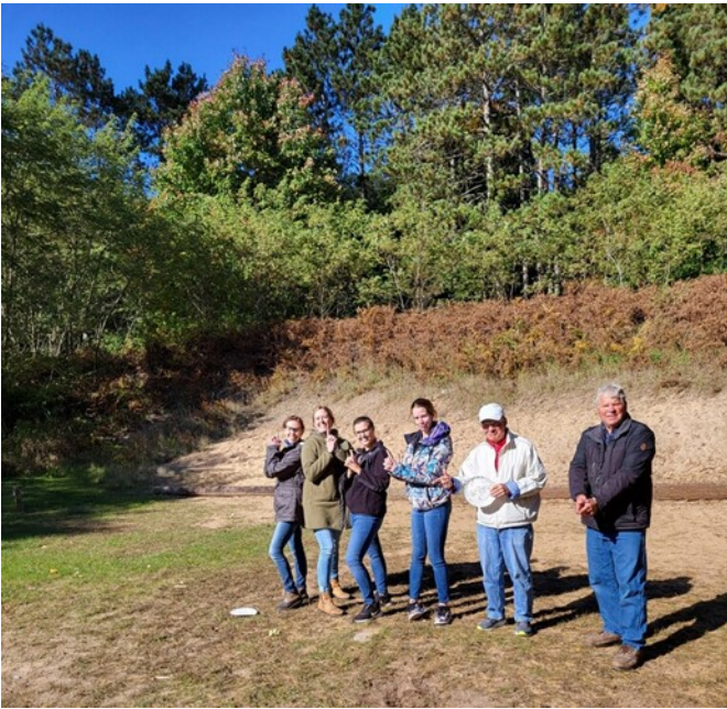
CPL Class of October 7 & 8. 6 successfully passed the class and received their CPL certificates.