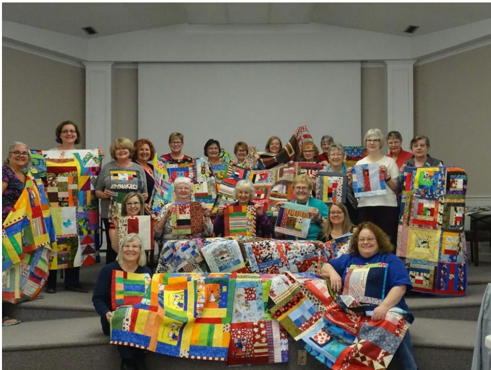
Some of the Retreat participants and their Quilts and Blocks for the CQA Canada's Big Quilt Bee for Ronald McDonald House Charities.

May 27 will be our final Sew Day for Ronald McDonald House. Come out and complete a quilt or sew on some binding. Sew Day is from 9:30 to 3:30 at Oshawa Senior Citizens Centre at 43 John Street West in the Lower Assembly room. Sign up at the May meeting and pay your $5.00. If you make something for RMH, you get your money back!!