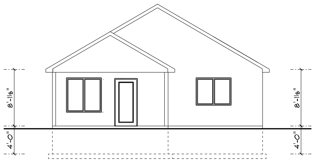
3 Rear Elevation Scale 1/8" = 1'-0"

SCALE DRAWN BY RKB JOB NUMBER SHEET NUMBER A1 SHEET 1 OF 3