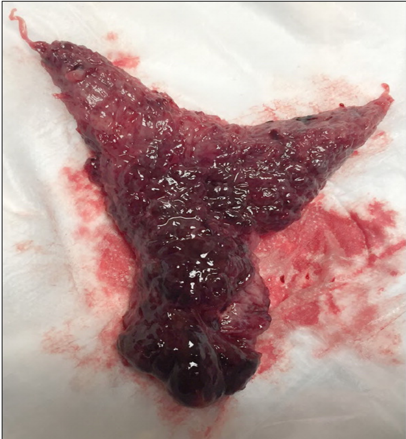
Figure 1. A decidual cast passed at a physician's office, after two days of severe abdominal pain and cramping. This patient started medroxyprogesterone six weeks prior to passing this mass measuring 5 cm × 6 cm × 1 cm. Her pelvic discomfort completely resolved after the mass was passed [15].