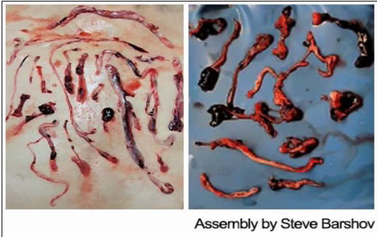
Figure 6. Post-mortem organized thrombi.