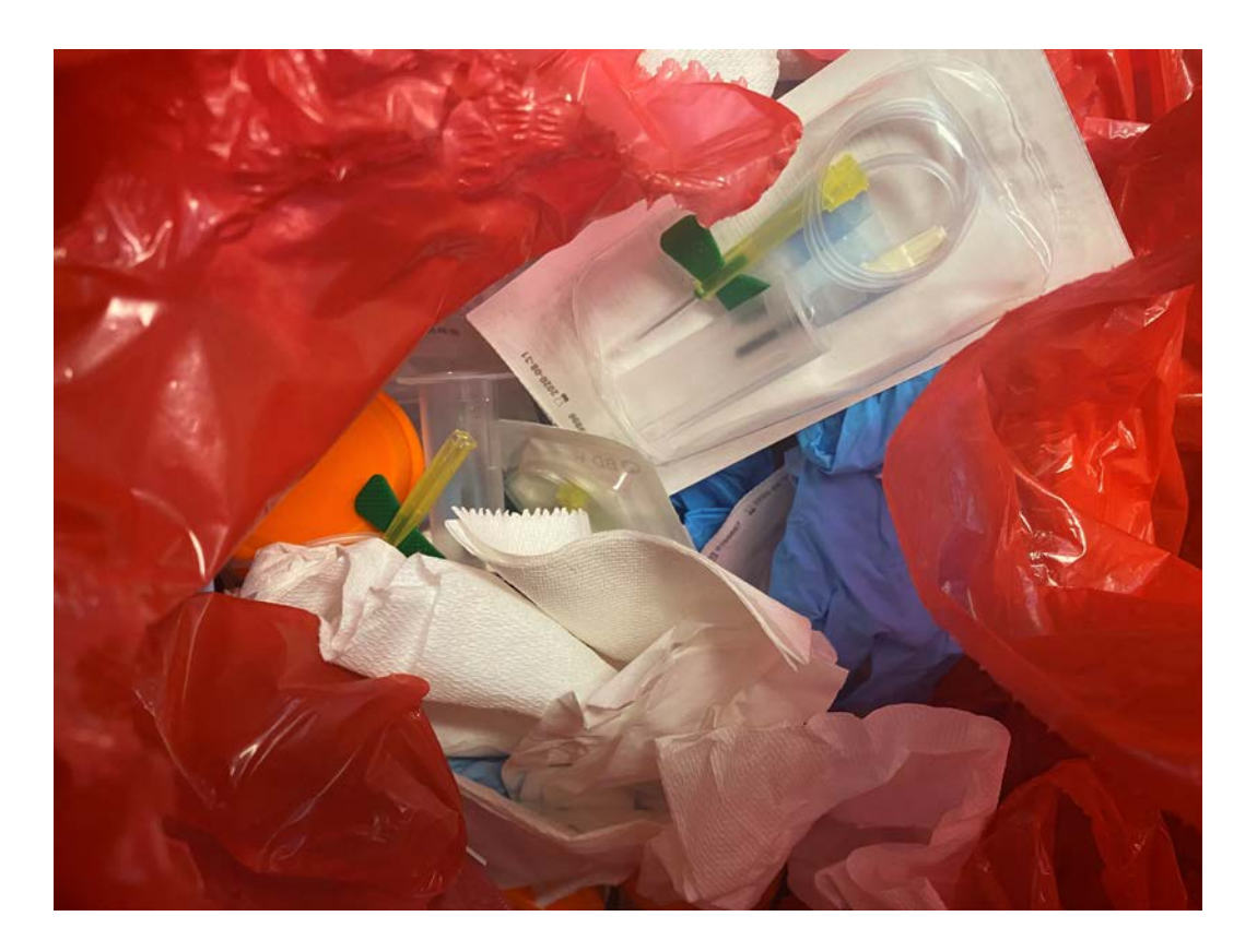
See also Ex. 3, Transcript of September 24 Meeting Recording, at 1–2. Biohazard bags are not puncture-proof, so this presented a serious risk to employees' safety.

245. That same night, Relator photographed ongoing HIPAA violations. Ventavia kept a calendar of patients to follow up with in public view in a reception area. The calendar contained patients' names and information. Similarly, patient records were left out in public view. Relator also documented that product cartons and patient randomization numbers from the BioNTech-Pfizer vaccine trial had been left in public view in a preparation area, potentially unblinding all Ventavia staff at the site and some patients as well: