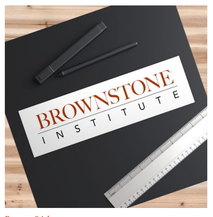
Bumper Stickers $7.00 – $8.00