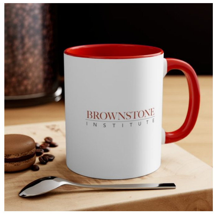
11oz Accent Mug $12.00