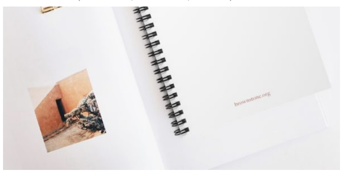
Brownstone Spiral Notebook $11.00