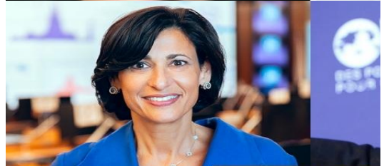
CDC director's only school reopening meeting with 'parents' was with far-left activists