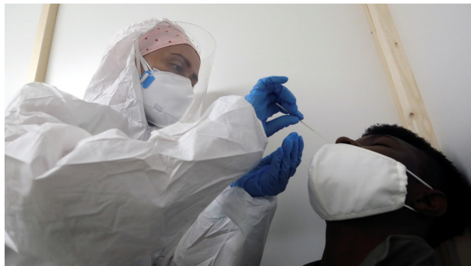
A member of the medical personnel performs a PCR test amid the outbreak of the coronavirus disease (COVID-19), in Charleroi, Belgium, November 5, 2020