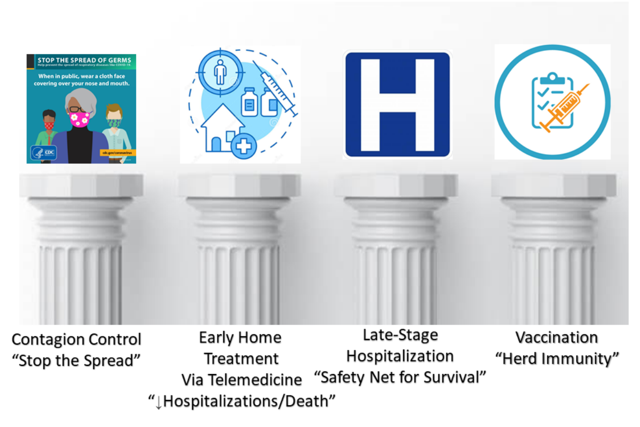
Fig. 1. The four pillars of pandemic response to COVID-19. The four pillars of pandemic response to COVID-19 are: 1) contagion control or efforts to reduce spread of SARS-CoV-2, 2) early ambulatory or home treatment of COVID-19 syndrome to reduce hospitalization and death, 3) hospitalization as a safety net to prevent death in cases that require respiratory support or other invasive therapies, 4) natural and vaccination mediated immunity that converge to provide herd immunity and ultimate cessation of the viral pandemic.

ferson et al., 2020; Xu et al., 2020). Masks for all unaffected contacts within the home as well as frequent use of hand sanitizer and hand washing is mandatory in the setting when one or more family members falls ill. Sterilizing surfaces such as countertops, door handles, phones, and other devices is advised. When possible, other close contacts can move out of the house and seek shelter free of SARS-CoV-2. Findings from multiple studies indicate that policies concerning control of the spread SARS-CoV-2 are only partially effective and extension into the home as the most frequent site of viral transfer is reasonable (Hsiang et al., 2020; Xiao et al., 2020). One of the great advantages of home treatment of COVID-19 is the ability of an individual or family unit to maintain isolation and complete contact tracing. If therapy is offered in the home with delivery of medications, then trips to urgent care centers, clinics, and hospitals can be reduced or eliminated. This limits spread to drivers, other patients, staff, and healthcare workers. On the contrary, therapeutic nihilism on the part of primary care physicians and health systems drives anxiety and panic among patients with acute COVID-19 who feel abandoned, making them more likely to break quarantine and seek aid at urgent care centers, emergency rooms and hospitals.