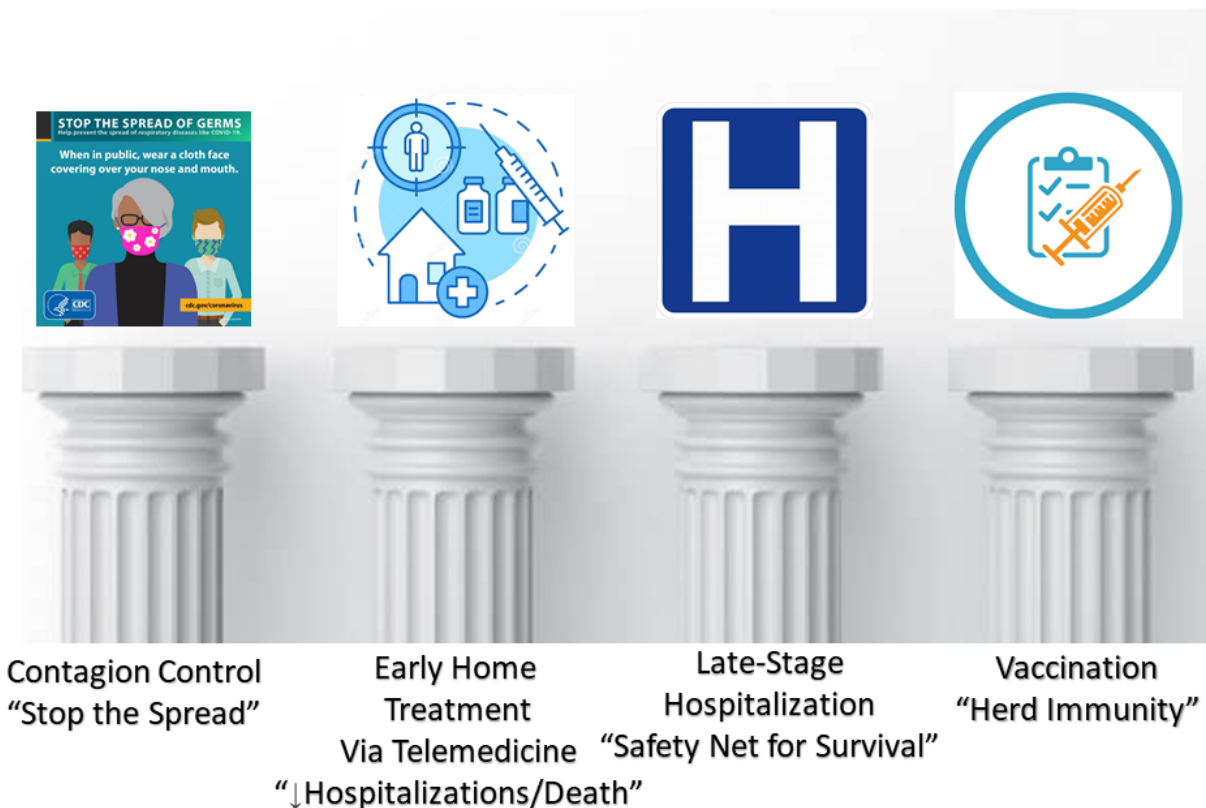
Fig. 1. The four pillars of pandemic response to COVID-19. The four pillars of pandemic response to COVID-19 are: 1) contagion control or efforts to reduce spread of SARS-CoV-2, 2) early ambulatory or home treatment of COVID-19 syndrome to reduce hospitalization and death, 3) hospitalization as a safety net to prevent death in cases that require respiratory support or other invasive therapies, 4) natural and vaccination mediated immunity that converge to provide herd immunity and ultimate cessation of the viral pandemic.

erson et al., 2020; Xu et al., 2020). Masks for all unaffected contacts within the home as well as frequent use of hand sanitizer and hand washing is mandatory in the setting when one or more family members falls ill. Sterilizing surfaces such as countertops, door handles, phones, and other devices is advised. When possible, other close contacts can move out of the house and seek shelter free of SARS-CoV-2. Findings from multiple studies indicate that policies concerning control of the spread SARS-CoV-2 are only partially effective and extension into the home as the most frequent site of viral transfer is reasonable (Hsiang et al., 2020; Xiao et al., 2020). One of the great advantages of home treatment of COVID-19 is the ability of an individual or family unit to maintain isolation and complete contact tracing. If therapy is offered in the home with delivery of medications, then trips to urgent care centers, clinics, and hospitals can be reduced or eliminated. This limits spread to drivers, other patients, staff, and healthcare workers. On the contrary, therapeutic nihilism on the part of primary care physicians and health systems drives anxiety and panic among patients with acute COVID-19 who feel abandoned, making them more likely to break quarantine and seek aid at urgent care centers, emergency rooms and hospitals.