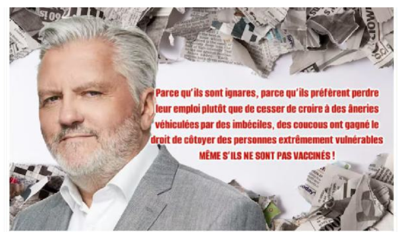
Richard Martineau, La victoire des coucous, Journal de Montréal, 14 octobre 2021.