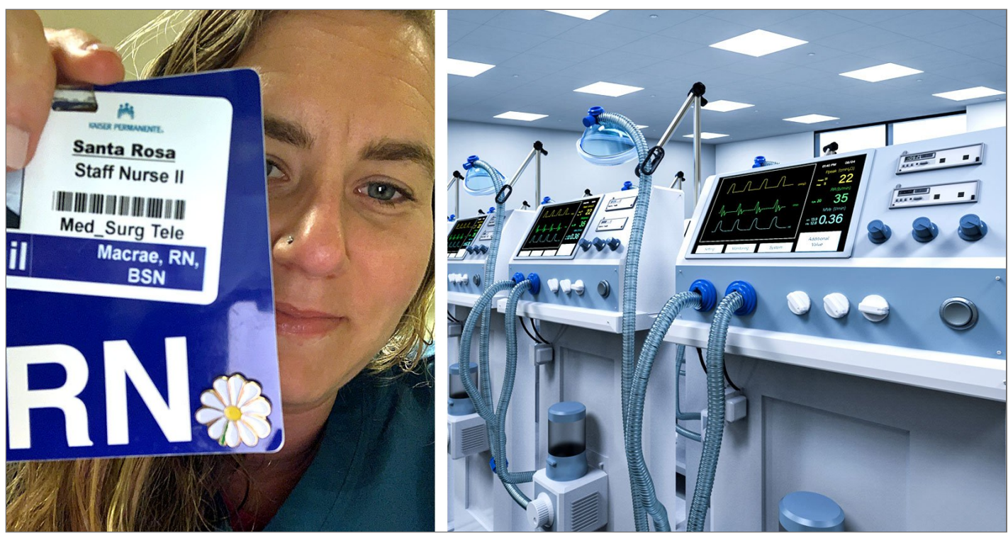
Miss a day, miss a lot. Subscribe to The Defender's Top News of the Day. It's free.