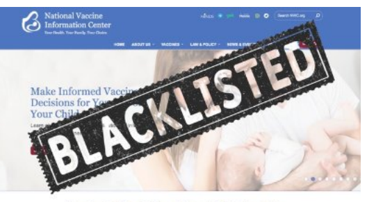
Protecting Health and Informed Consent Rights Since 1982

We need your help because people tell us over and over again, that when they conduct online searches, it is almost impossible to find NVIC.org, a website we established in 1995 and today is the oldest and largest consumer operated website on the Internet publishing information about vaccines and diseases.