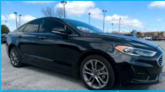
2023 HONDA CIVIC Si $30,949 STK 5230236A