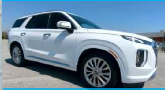
2020 HYUNDAI PALISADE LIMITED $33,896 STK 5230026U

Video Walkaround • Test Drive at Home • Home Delivery • Maintenance Pick-up • Purchase Online FREE DELIVERY ANYWHERE IN GEORGIA!