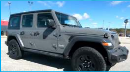
2018 JEEP WRANGLER UNLIMITED SPORT $27,799 STK 4230297A