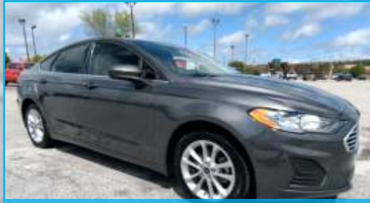
2020 FORD FUSION HYBRID SE $17,922 STK 4UA0273