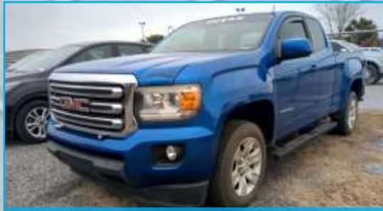
2018 GMC CANYON SLE1 $21,980 STK 4230262C

WE'RE TAKING THOUSAND$ OFF 2023 & 2024 MSRP! PRE-OWNED SPECIALS • USED CARS • TRUCKS • SUV'S