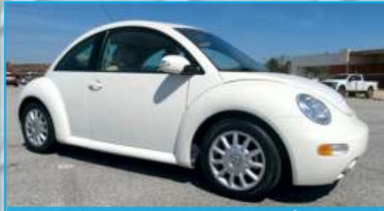
2004 VW BEETLE GLS 2.0 $6,587 STK 5240012B