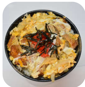
Pork katsu don