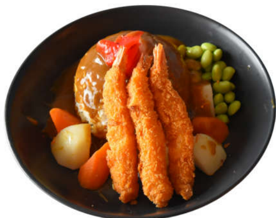
Prawn Katsu Curry