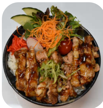
Teriyaki chicken don

Pan-fried sliced pork with sweet sesame soy, served with sautéed capsicum, cabbage & onion on a bed of steamed rice topped with sesame seed, red pickled ginger & dried seaweed.