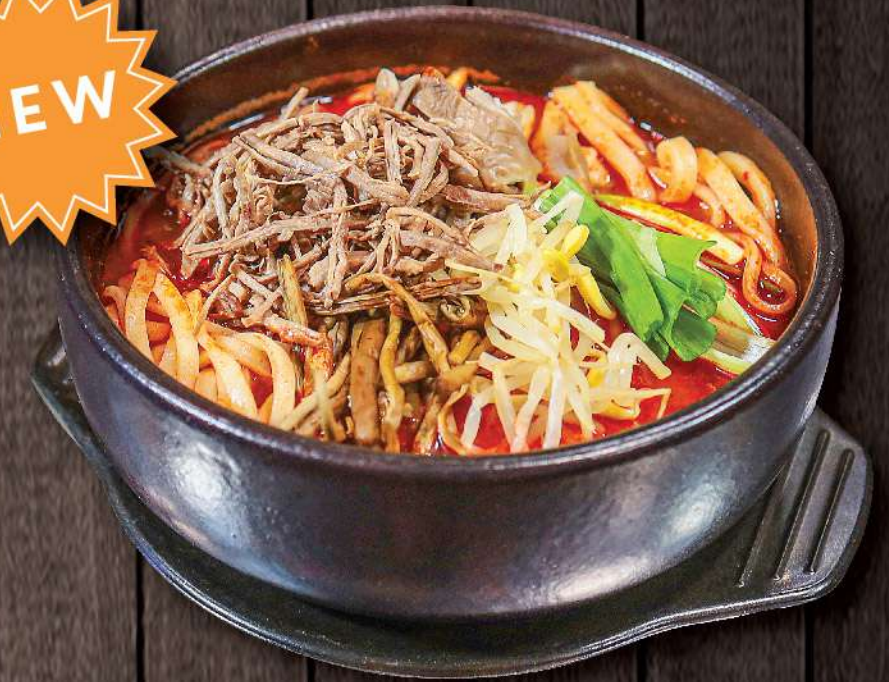
Yuk Gae Jang (Spicy Beef) Noodle 🌶️ 육개장 칼국수 17.50