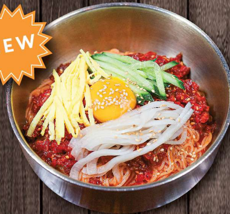
Hobak Tartare' Noodle 🌶️ 육회 비빔면 16.50