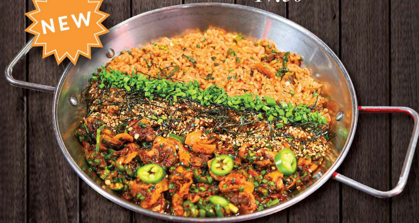
Cockle (Clam) Bi Bim Bap 🌶️ 꼬막 비빔밥 17.50