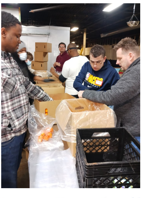
Keep up the good work!