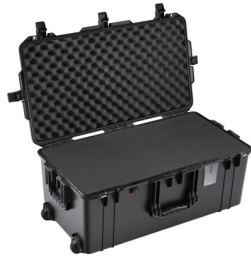
1626WF With Foam