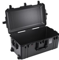
1626NF No Foam