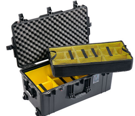
1626WD With Padded Dividers