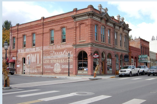
2007 - President's Mystery Tour to Jacksonville