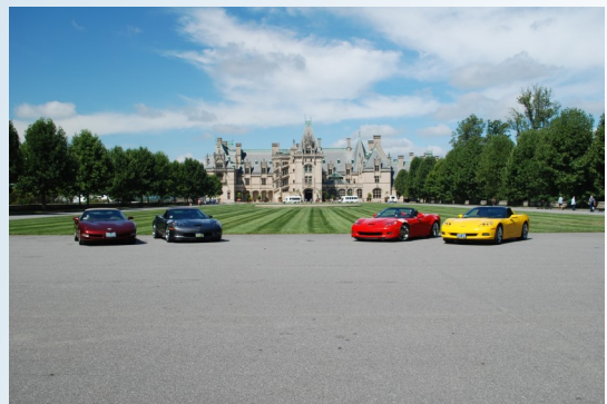
2014 - CCC at The Biltmore Estate, NC