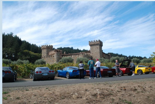
2013 - CCC in Napa, CA