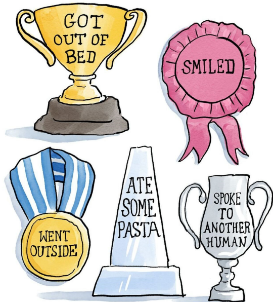
BECKY BARNICOAT FOR GRAZIA