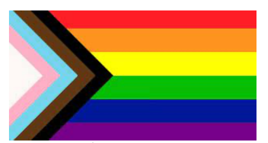
Progress Pride/Inclusive Flag (created by Daniel Quasar 2018)

Two-Spirit – An umbrella term used in many Indigenous communities to describe someone operating in a third gender societal or ceremonial role.