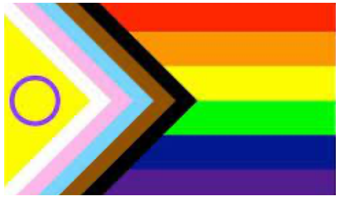
Progress Pride/Inclusive Flag (created by Daniel Quasar 2018)