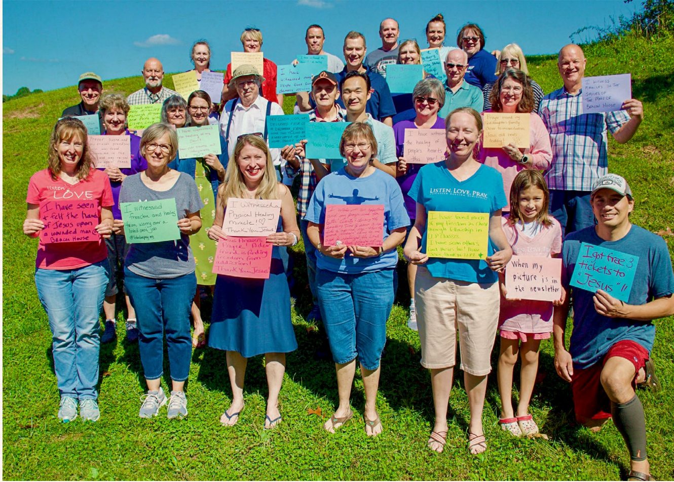
A group photo from the 2021 LLP Volunteer Appreciation Picnic

The work we do at Listen Love Pray Foundation does not happen without the love, faithful commitment, and contribution of time and effort by our volunteers. They are an integral part of what we do. As noted above, our volunteers contributed more than 6,000 hours to the ministries of Listen Love Pray Foundation. They tirelessly and passionately share the love of Jesus, and it is because of their time, energy and love that we have been able to expand our ministries so significantly in 2021. One of the ways we recognize them is through our annual volunteer picnic, which was held in September of 2021. We are so thankful for all they contribute to the foundation.