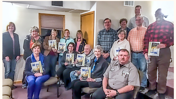
Top: The Thursday night class for Hearing God’s Voice.

God is constantly speaking His truth to us. If we have eyes to see, He brings new vision to old things. He gives us courage when we remember who God is, was, and always will be. We praise God as we raise up our words of testimony. And we pray, Lord Jesus, that you free all those who read this issue from the yoke of this world. Help us to set our hearts again on the eternal truth of the promised one.