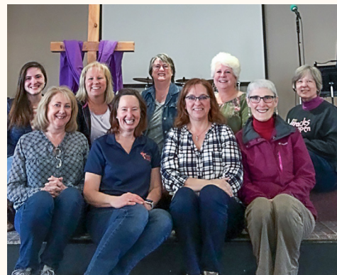
Left: The Monday morning class for Hearing God’s Voice