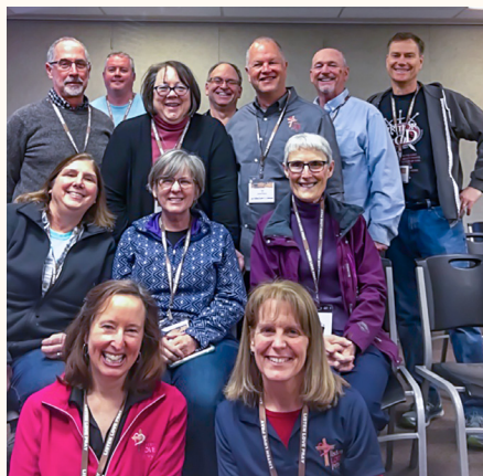
LLP Intensive Prayer Ministry team and some prayer recipients from the Frederick Rescue Mission