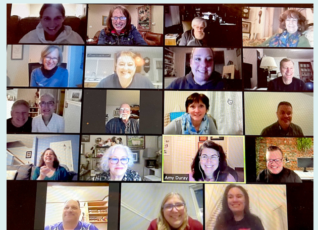
LLP's 'Hearing God's Voice' class picture!

29 students learned more about hearing God in LLP's March class! See two testimonies from this class in this newsletter under 'God Speaks!' and view the recorded classes on our YouTube channel . Join us for April's classes to learn more about healing prayer and intercessory prayer.