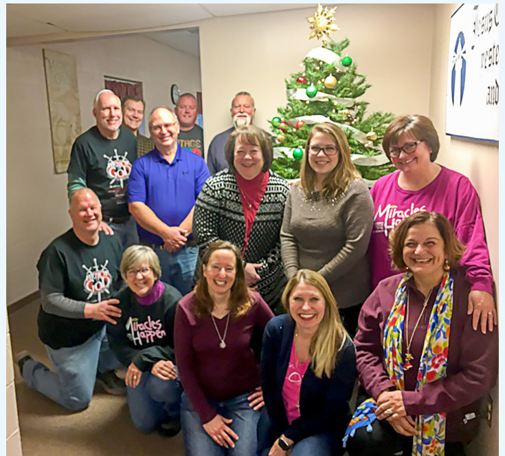
LLP at Frederick Rescue Mission (above)