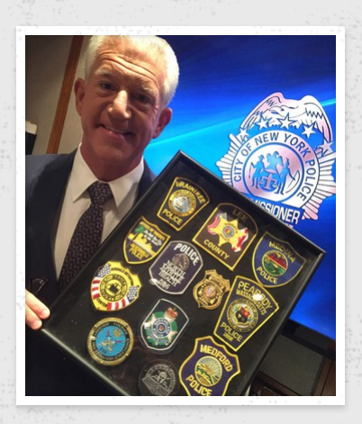
See our patches?