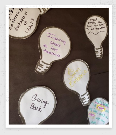
A small portion of the art