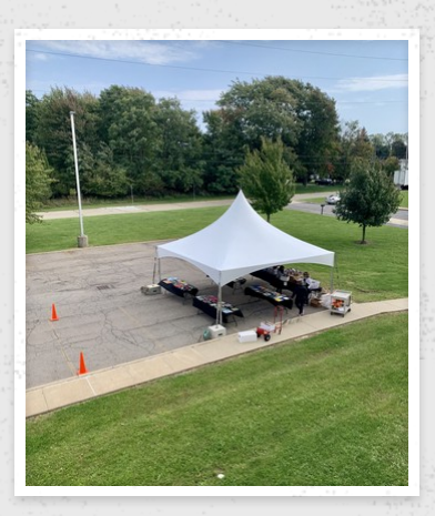
Art pickup in our parking lot fortunately the weather was beautiful!