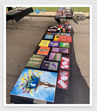
Some of the art from previous years.

A huge "thank you" to Access the Arts for their sponsorship this year and their continued support as they volunteered their time to help people pick up their winnings!