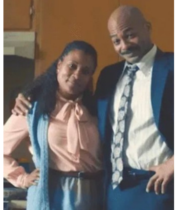
1 episode | 2021

Cast as Randall's "Ghost Kingdom Mom" in the Season 5 episode of "Brotherly Love"