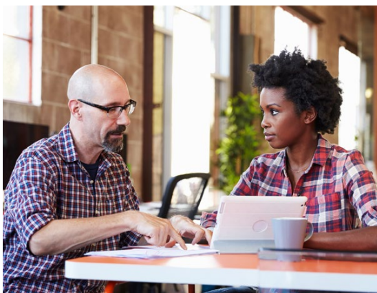
Can your peers help with your writing? p. 24