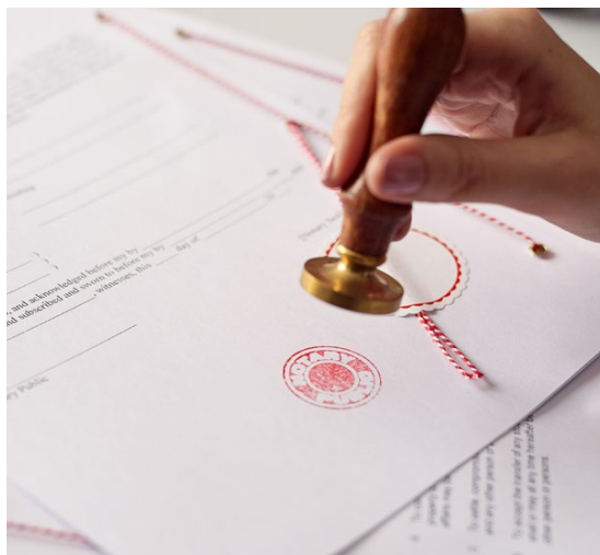
Do your documents have the correct stamps and signatures? p. 11