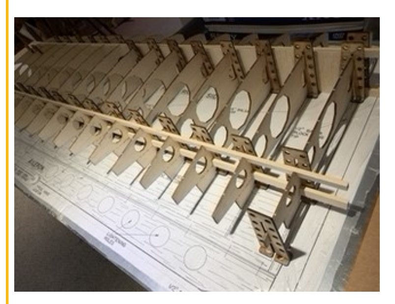
Ribs in place along fore and aft spars.