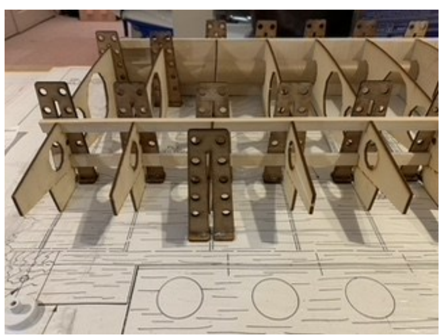
Magnets at the base of each rib guide grips to the metal sheet beneath the plans. Ribs are held in perfect 90° alignment for gluing.

great and when I lifted the wing off of the table nothing stuck to the plans or the table.