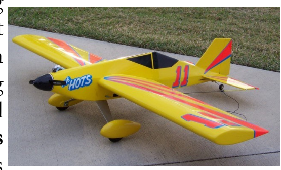
The Big Hots 91"

was the thousands of pins needed to nail the balsa down to the plans. The Big Hots has a big wing and getting it straight was mandatory.