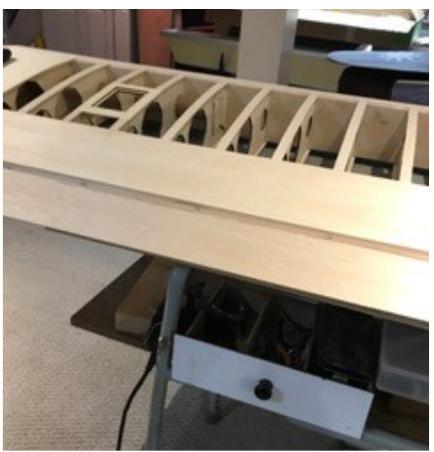
A true and warp-free wing out of the jig.