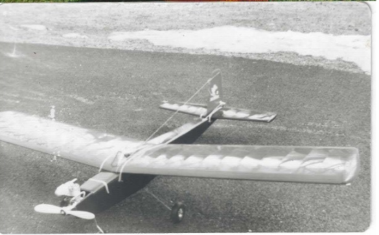
Aeromaster (top) Falcon 56 (bottom)

solar film (the cheap monokote at the time) and after takeoff,