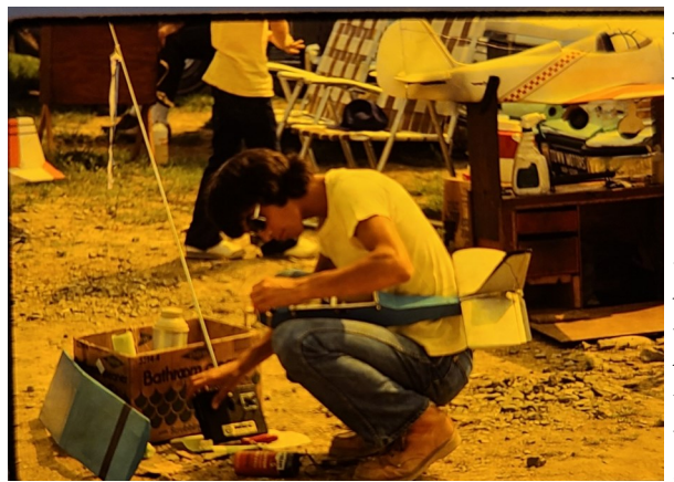
3-channel MRC radio with slider-tab throttle on left

later. This was a fantastic plane, and with this Enya .40, it was grossly overpowered for a beginner – something I learned about 20 flights later. The old-timers at the club up in Montvale, NJ (Philips Parkway) where I learned to fly, kept telling me that my wing was buckling from the tight