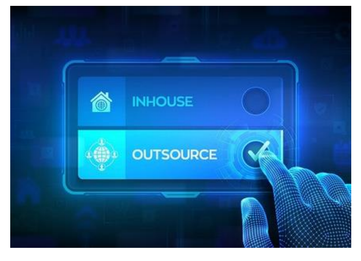
Talent Process Outsourcing (TPO)