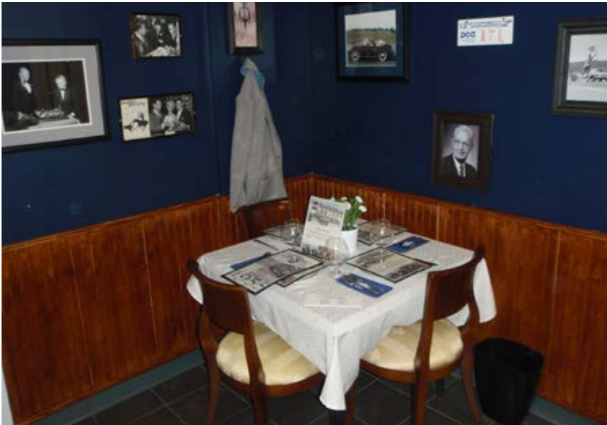
PCA Headquarters Reproduction of First PCA Meeting