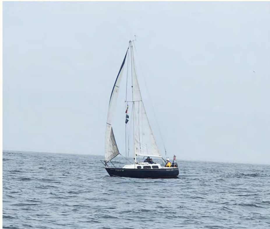
Weekend cruise, March 11-12, 2023 Tinkerbell and Coastal Eddie