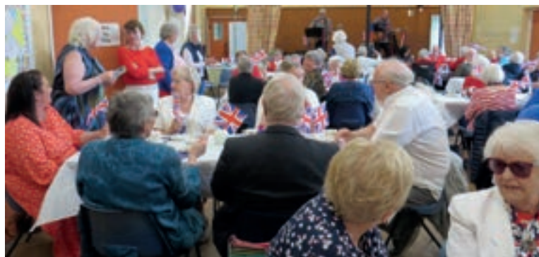
The Jubilee Luncheon

Upwell and Outwell Age Concern Luncheon Club