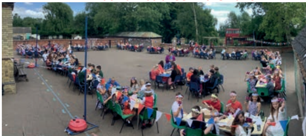
Upwell Academy 'street' tea