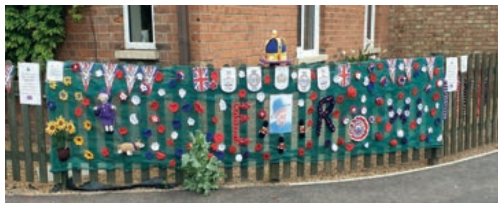
Welle W I Jubilee Decorations