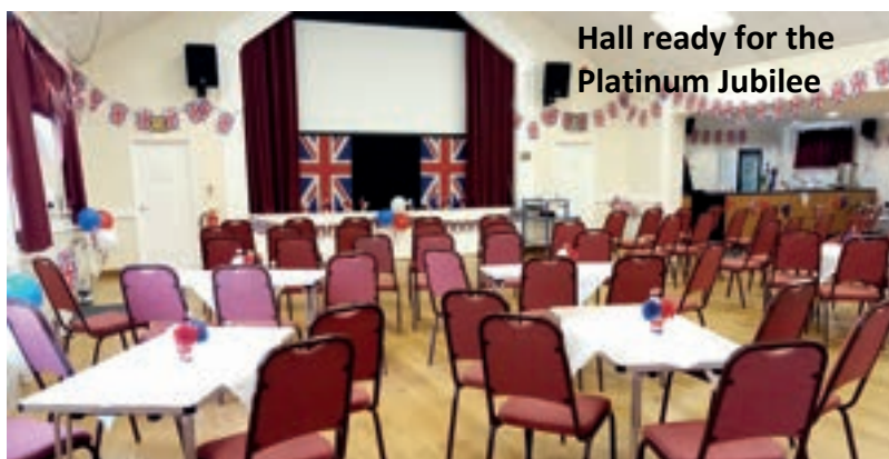
Hall ready for the Platinum Jubilee