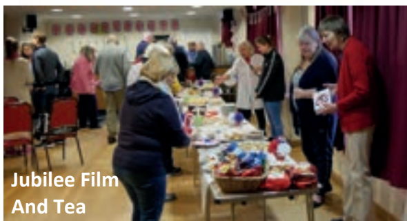
Jubilee Film And Tea

Everyone that came along really enjoyed our Platinum Jubilee Film & Tea Celebration – huge thanks to all the trustees and volunteers that organised the event, decorated the hall and made all the cakes and other food in advance of the day.