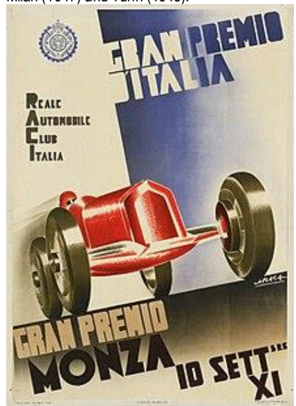
The above information was taken from the 2022 Wikipedia

The Italian Grand Prix counted toward the World Manufacturers' Championship from 1925 to 1928 and toward the European Championship from 1931 to 1932 and from 1935 to 1938. It was additionally designated the European Grand Prix seven times between 1923 and 1967, when this title was an honorary designation given each year to one Grand Prix race in Europe. Four editions before the World Championship were held in places other than Monza: Montichiari (1921), Livorno (1937), Milan (1947) and Turin (1948).